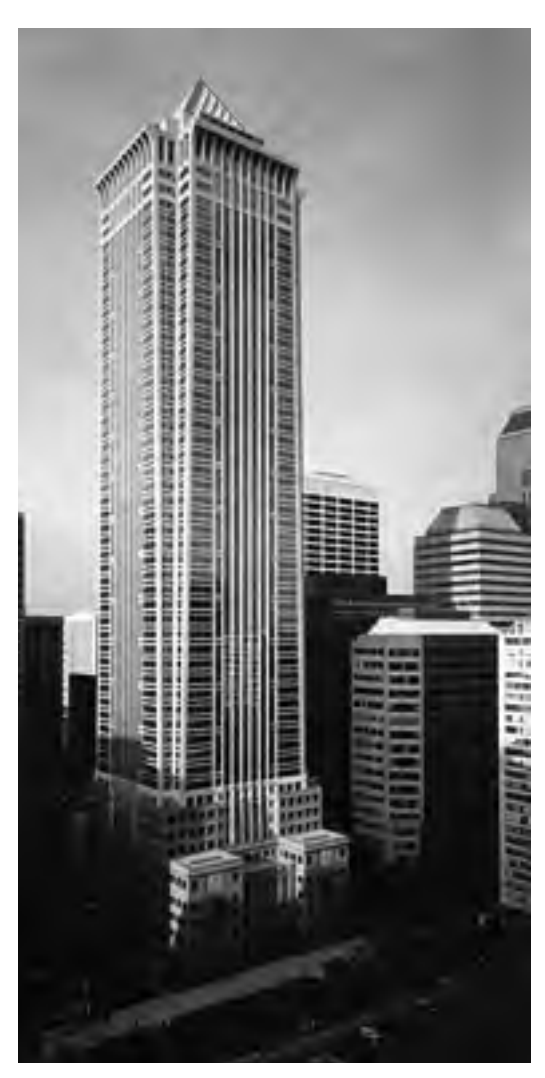
Mellon Bank Building 18th and Market Streets, Philadelphia