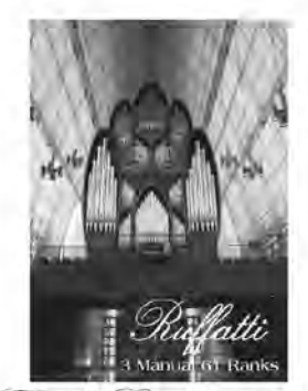
Fratelli Ruffatti Pipe Organs Padua, Italy

Sligo Seventh Day Adventist Church Takoma Park, Maryland